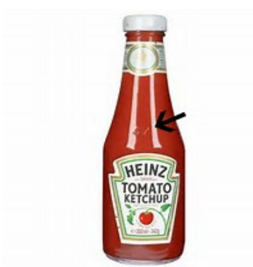
Image 1: Plastics are Non-Newtonian shear thinning materials, similar to ketchup

Now, let's focus on Non-Newtonian fluids, specifically Shear Thinning fluids, like ketchup and plastic. Wait, what? I thought we were discussing plastics. Let me explain.